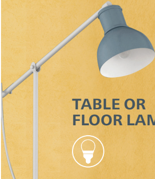
TABLE OR FLOOR LAMPS

Use this key to select the LED styles that are best suited for your home and fixtures.