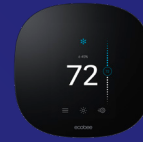
ENERGY STAR certified smart thermostats