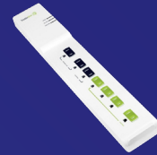
Advanced power strips